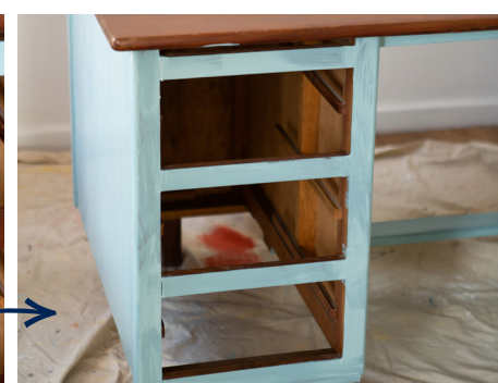
1 Clean all surfaces of the desk with lacquer thinners and a dry cloth. Let it dry completely and remove the handles from the drawers. Then paint the base of the desk with two coats of Coral Stone, letting the paint dry between coats.