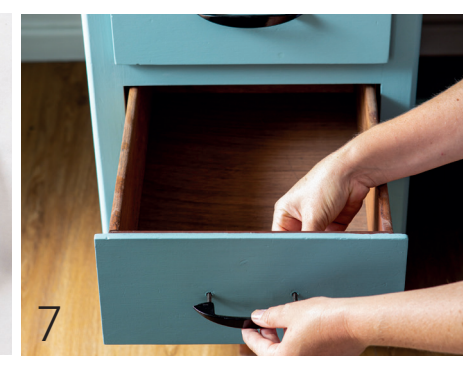
7 Screw the handles back in place once the paint has dried and put the drawers back into the desk. >>

home PAINT IT 2021 85 CONTACT Shelly Bergh shellybergh.com