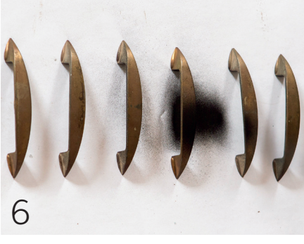
an imperfect spot. 6 Spray the handles with two coats of the black spray paint. Allow the paint to dry between coats.