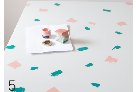
5 Use the sponges and paint from the four sample pots to stamp terrazzo-style splodges on the desktop. Simply push the sponge down and drag it a little to create