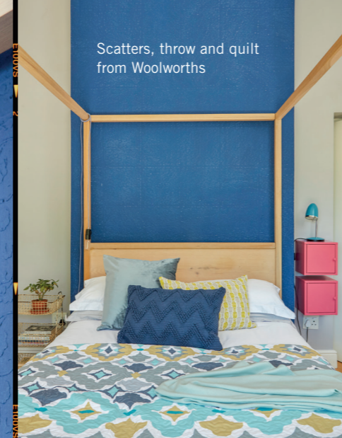
Scatters, throw and quilt from Woolworths

If you don't want a painted wallpaper effect (as above), you can sand the wall with 100-grit sandpaper – the more you sand, the more the white Stencil of Paris will show through. If you prefer, you can paint the wall first and then apply the white Stencil of Paris for a more dramatic look.