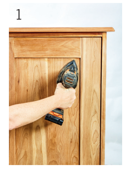
1 Remove any sealant or varnish from the wood to create a raw wood look.