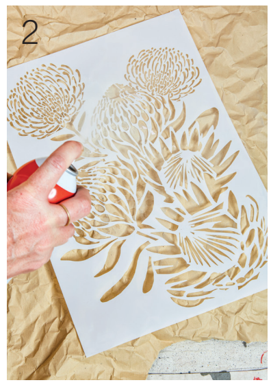
2 Spray the back of the stencil with the spray adhesive.