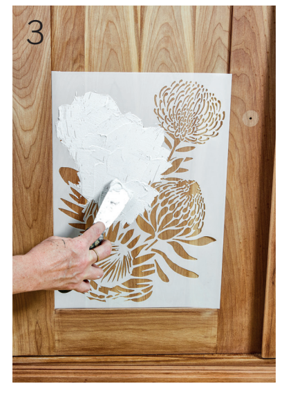
3 Position the stencil and apply the Stencil of Paris with a scraper; wipe off any excess Stencil of Paris as you go along.