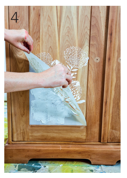
4 Remove the stencil carefully, whilst the Stencil of Paris is still wet. Be careful not to smudge it.