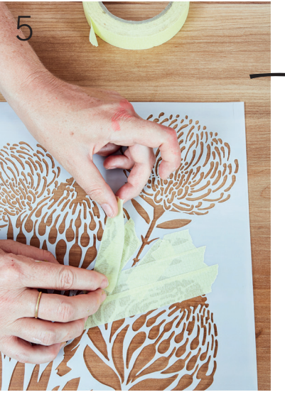
5 We used the entire stencil on the bottom left of one door, but for the rest we isolated the pincushion flower by covering the cut-outs next to it. Apply spray