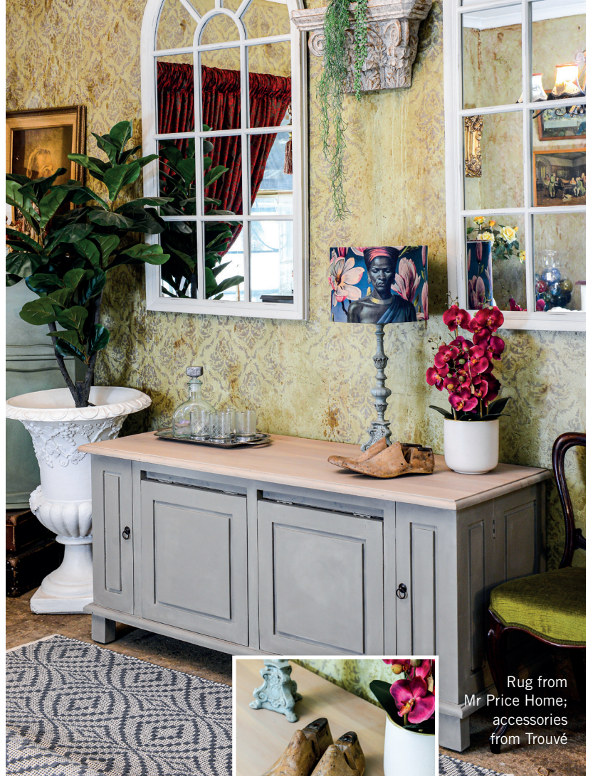
Rug from Mr Price Home; accessories from Trouvé

3 Dilute your paint with water (1:1). Paint the top, wiping off any excess. Once the paint wash is dry, seal it with Gripseal Resilience Matt. Seal the base of your piece with either Annie Sloan Clear Wax or Lacquer Matt. 🏠